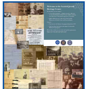
SJHC Welcome Panel