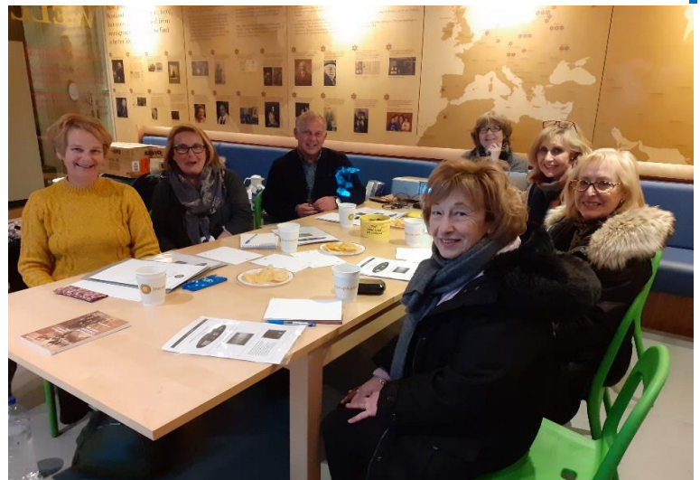
Training volunteers for the new Heritage Centre

A small volunteer team continues to raise revenue funds to give the new Centre a firm financial footing for its first 5 years. If you would like to assist with this, please let us know.