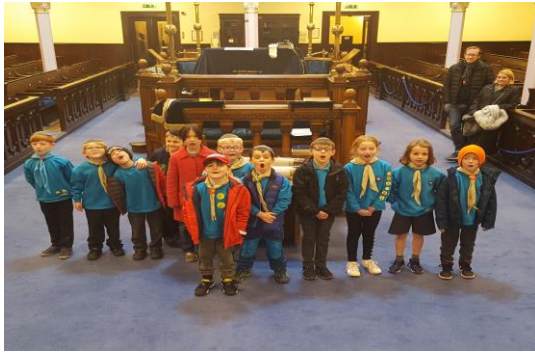
Kelvinbridge Beavers, November 2019