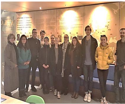
Glasgow University Introduction to Judaism students