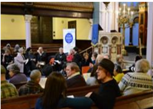
In January, The Archives Centre hosted the Interfaith Scotland Tackling Hate Together Dialogue Event in Garnethill Synagogue